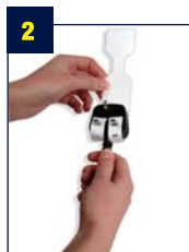
2 You have a choice of two sets of holes dependent on how much grip you require.