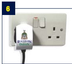
6 Now put the plug into the socket and it is ready to use.