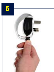
5 This is how it should look.