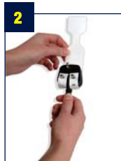
2 You have a choice of two sets of holes dependent on how much grip you require.