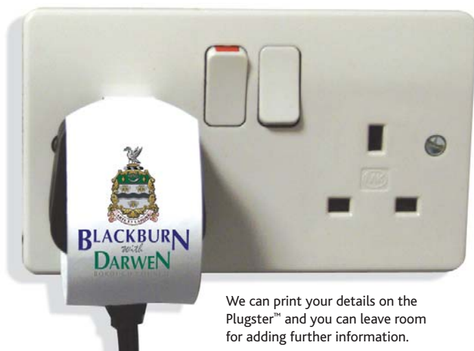
We can print your details on the Plugster™ and you can leave room for adding further information.

This product would be ideal for councils, charitable organizations or even electrical outlets, who can leave their details with customers and potential customers. The information will remain on view for a long time.