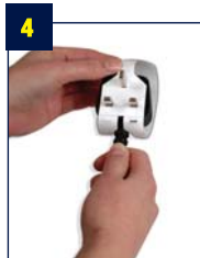
4 Position onto the plug pins.