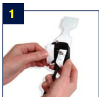
1 Put the bottom section onto the plug as illustrated.

It is a simple, low-cost, machine recyclable solution with the potential to help millions of British people who find removing plugs a daily challenge. Made of durable HDPE, they provide a superb advertising medium.