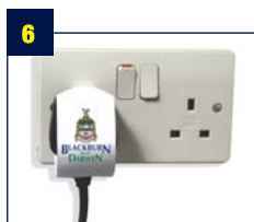
6 Now put the plug into the socket and it is ready to use.