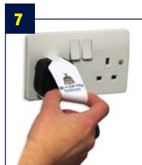
7 You can now use the Plugster™ and have your details on show.

The Plugster™ is also perfect for use as a labelling system to identify which plug belongs to which electrical appliance - great news for anyone. The Plugster™ means an end to the confusion of electric cables behind a TV, Hi-Fi or PC.