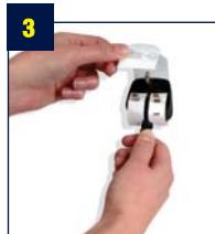
3 Now get hold of the top section and pull over the plug.