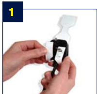
1 Put the bottom section onto the plug as illustrated.

It is a simple, low-cost, machine recyclable solution with the potential to help millions of British people who find removing plugs a daily challenge. Made of durable HDPE, they provide a superb advertising medium.