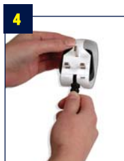
4 Position onto the plug pins.