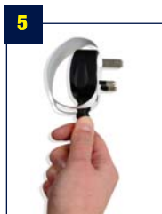
5 This is how it should look.