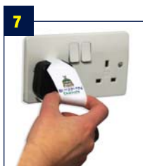
7 You can now use the Plugster™ and have your details on show.

The Plugster™ is also perfect for use as a labelling system to identify which plug belongs to which electrical appliance - great news for anyone. The Plugster™ means an end to the confusion of electric cables behind a TV, Hi-Fi or PC.